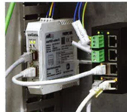
Physically separate network interfaces in the uaGate SI Gateway offer maximum protection from attacks.