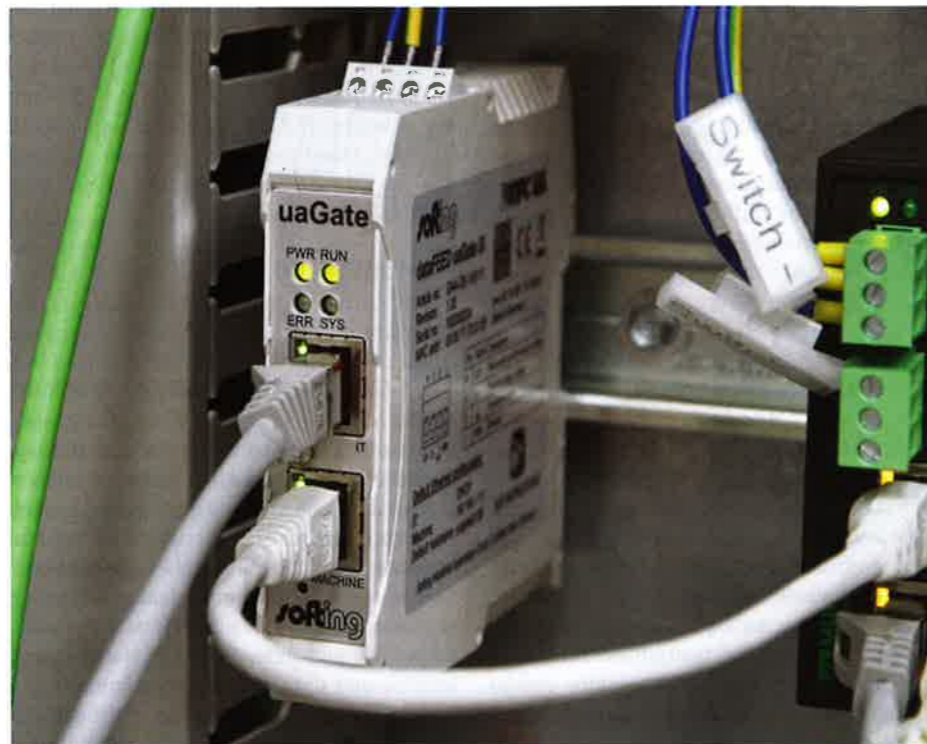
Open, platform-independent OPC UA technology offers straightforward networking at a local and a global level, along with allowing secure data traffic through a firewall.